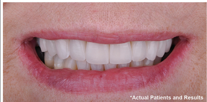
*Actual Patients and Results

HOUR TOPDENTISTS DETROIT 2021, 2022 & 2023